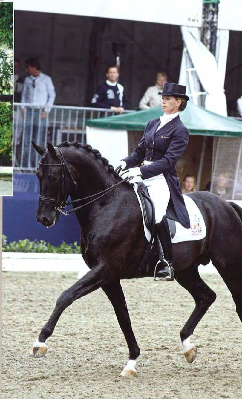
Anky van Grunsven shows Painted Black at international level Grand Prix. The KWPN stallion is the best Royal Dutch Sporthorse in the most recent WBFSH dressage rankings.