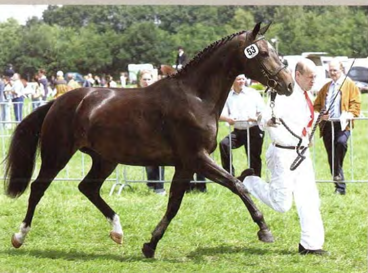
Litchy's half-sister Vogue (s.Negro) was declared provisional keur at the 2005 Central Keuring in Sevenum. She has since been sold to a buyer in England.