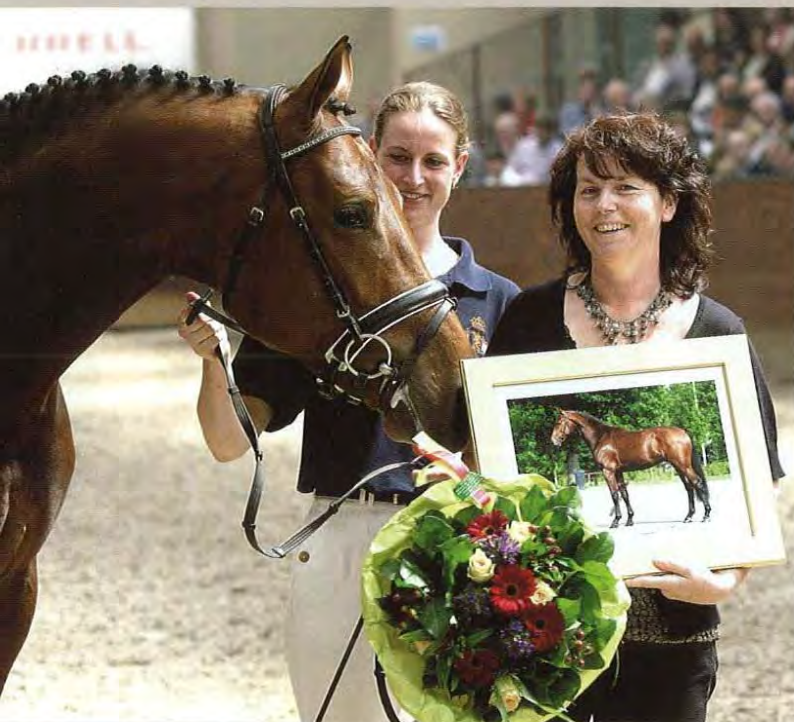
It is clear where he gets his talent. Zizi Top, who was approved in 2007, is Litchy's second KWPN approved son.