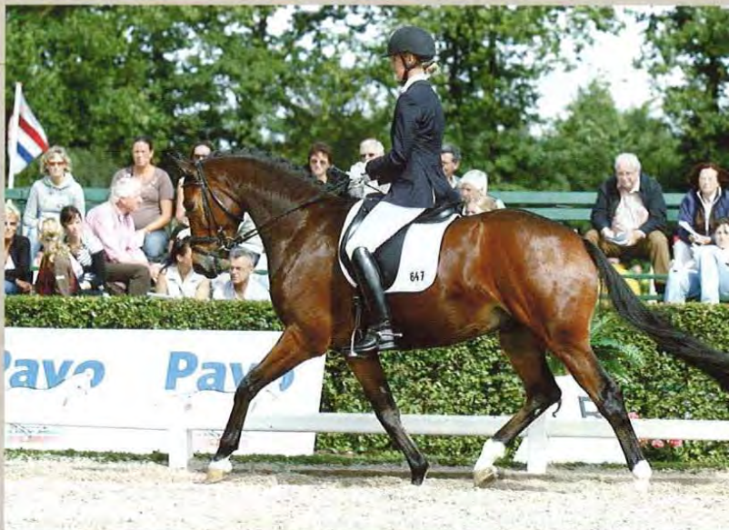
Wiseguy, a full brother to Painted Black, advanced to the semi-final of last year's Pavo Cup.